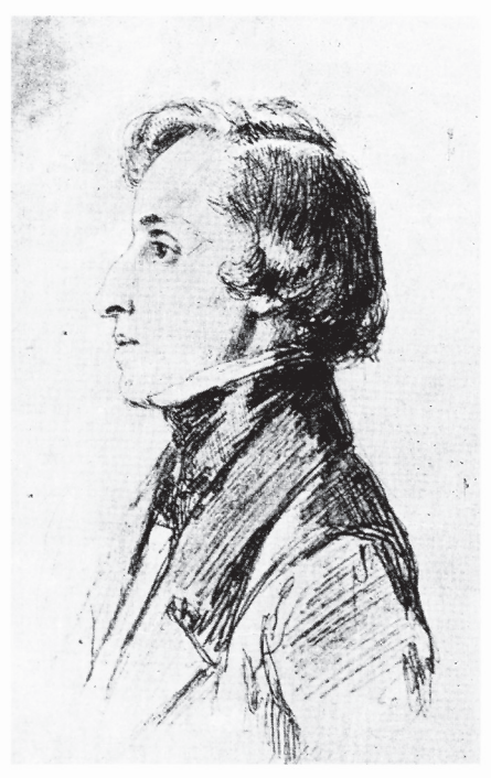
reading Chopin across 200 years the heart of Polish Romanticism