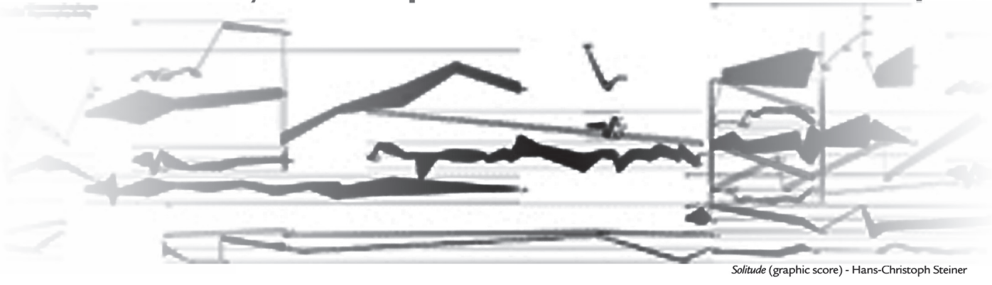
National Association of Composers/USA • National Conference

fEARnoMUSIC + guest artists + music of our time Sherman Clay 3/10@8pm + Old Church 3/11-12@8pm